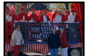
Float for the Veteran's Day Parade in Indiana